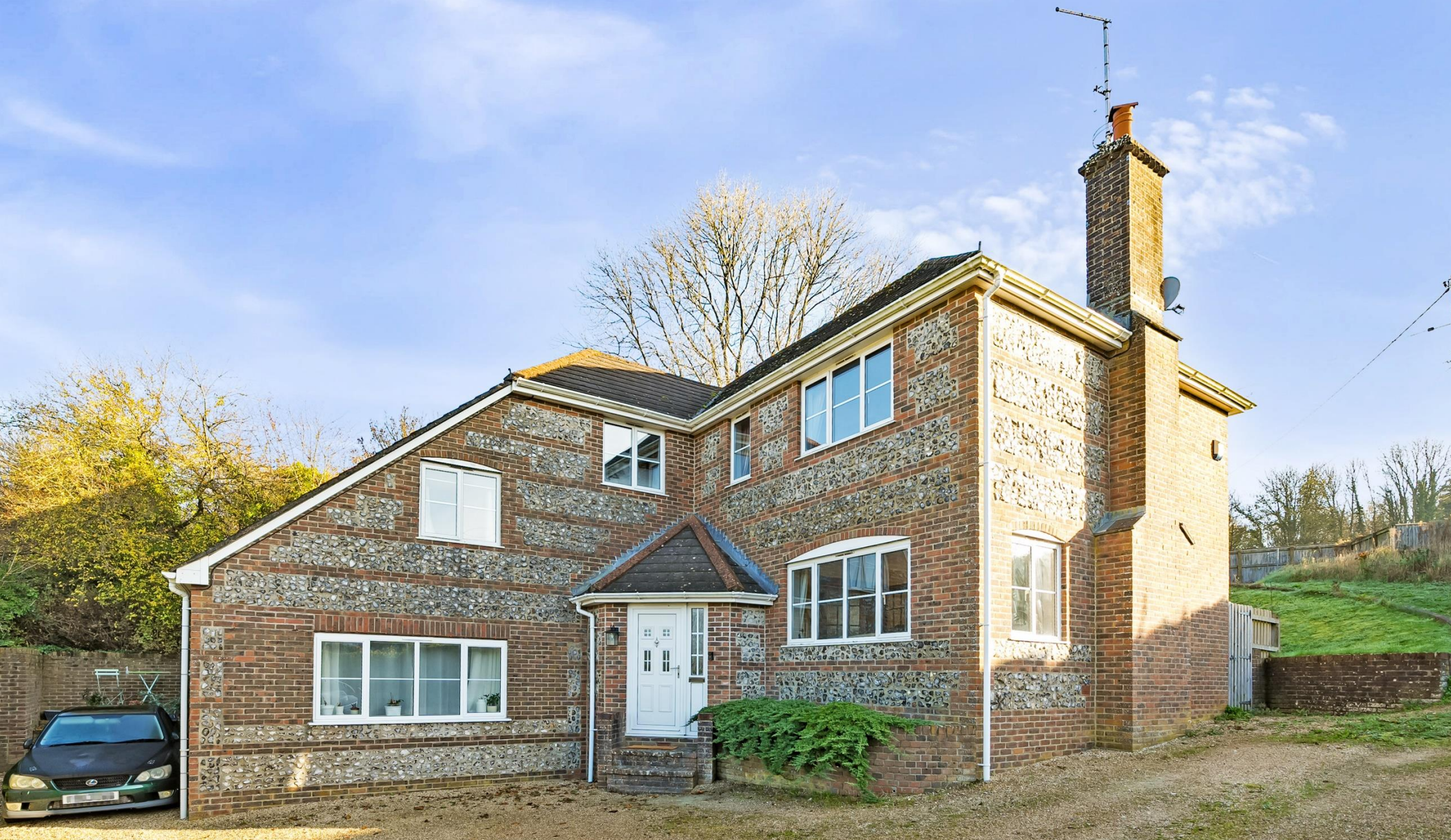
Greenacre Lodge Grimstone